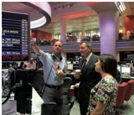
General Karl Eikenberry visits the new BBC studios prior to appearing on the 'Today' programme

AWARDS WORTH £1.5 MILLION TO RESEARCHERS IN BRAZIL, MEXICO, SOUTH AFRICA AND TURKEY