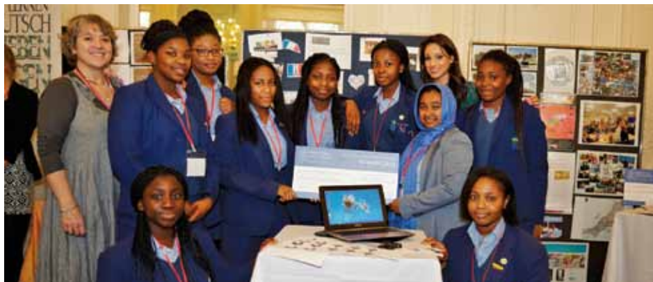
Mind Your Language International, a community school providing after-school drama activities in French for students from BME backgrounds in the Hackney areas of London, was one of the winning entrants in this year's British Academy Schools Language Awards.

The Academy's Skills Acquisition Awards have this year provided support for 15 early career researchers across 13 institutions to enhance their quantitative skills.