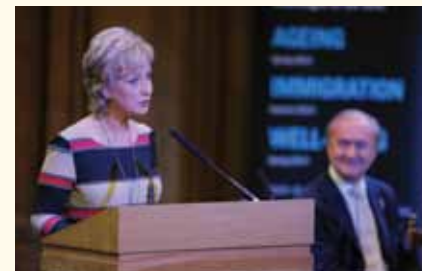
BBC presenter Sally Magnusson chairs one of British Academy's debates on Ageing in Edinburgh.

We were delighted to work with the Barrow Cadbury Trust on the 'Immigration' series, which brought new audiences to the debates. Further policy-related events held in partnership with The Guardian and a British Academy conference on 'Aliens, Foreigners and Strangers in Medieval England' in March 2015 provided valuable historical perspective on the subject.