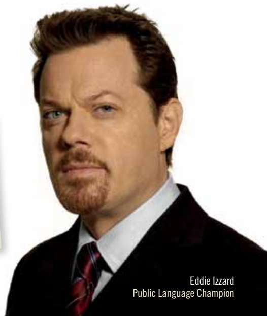
Eddie Izzard Public Language Champion

The Academy has been particularly active in promoting the importance of studying foreign languages, at all levels. A two year partnership with The Guardian included a series of high profile public events, fringe events at party conferences, Schools Language Awards, and a month-long Language Festival – at which Eddie Izzard was voted this year's Public Language Champion. New Academy reports highlighted two significant issues: how deficits in language skills undermine the UK's security and its capacity for global influence, and the importance of language skills to UK business and commerce (see page 16).