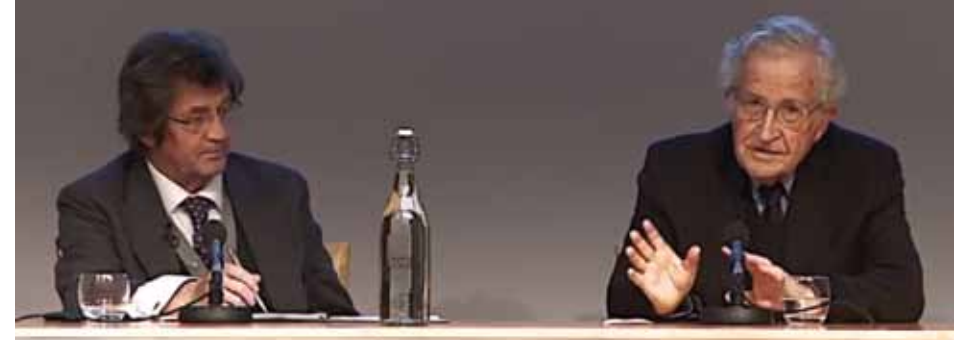
Professor Noam Chomsky FBA Lifetime Achievement in the Scholarly Study of Linguistics

Together, the projects have produced 33 new volumes or editions during the past year, and over 50 articles, book chapters and reports. These include The London and Middlesex 1666 Hearth Tax Return , one of the great documents of London history including coverage of the Great Plague of 1665 and the Great Fire of 1666.