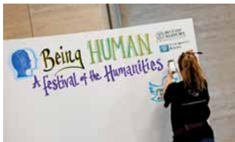
An illustrator 'live sketches' the opening night of Being Human, the first national festival of the humanities held in November 2014. A second festival takes place next autumn.

stories. Coverage ranged from the BBC Radio 4's Today to the Metro , The Times , The Daily Telegraph , The Guardian , The Financial Times and new media outlets such as Stylist and Londonist .