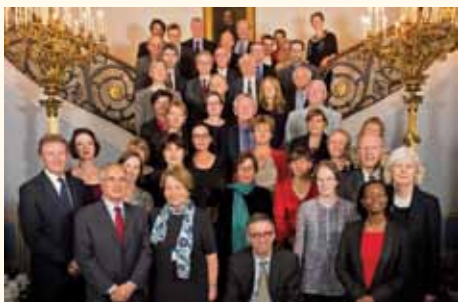
British Academy President Lord Stern (second left) welcomes this year's newly elected Fellows.