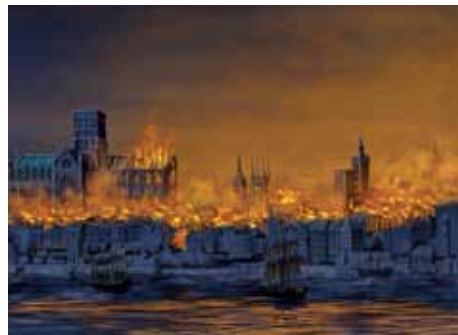
The London and Middlesex 1666 Hearth Tax Return, one of the great documents of London history covering the impact of the Great Plague of 1665 and the Great Fire of 1666, is one of 55 kitemarked British Academy Research Projects.

The annual contribution to the funding of these projects is around £225,000, but this core funding enables the projects to raise funds from other sources currently totalling over £15 million.