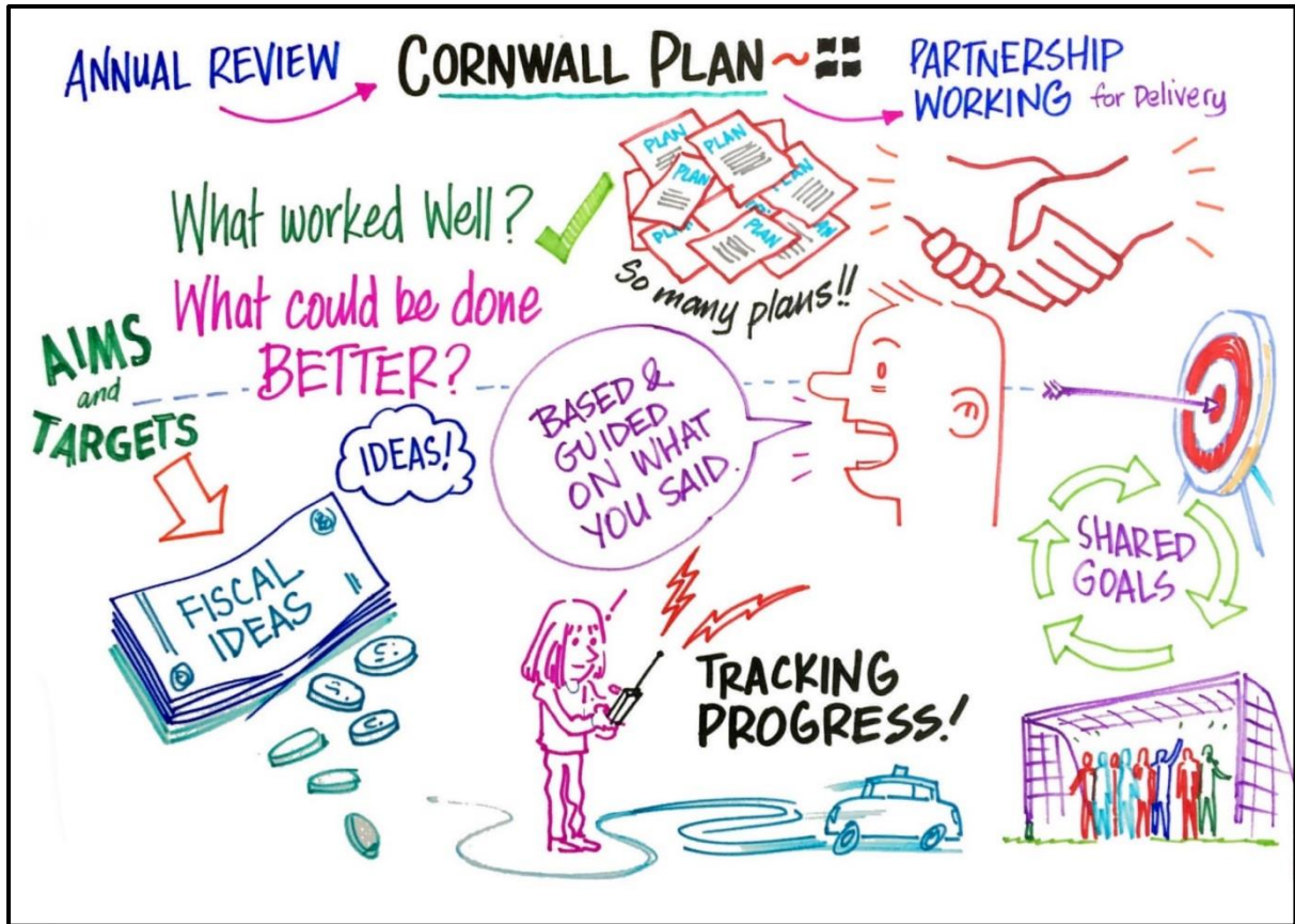
Figure 1: The task at hand for the first workshop, January 2022. Illustration by Keith Sparrow