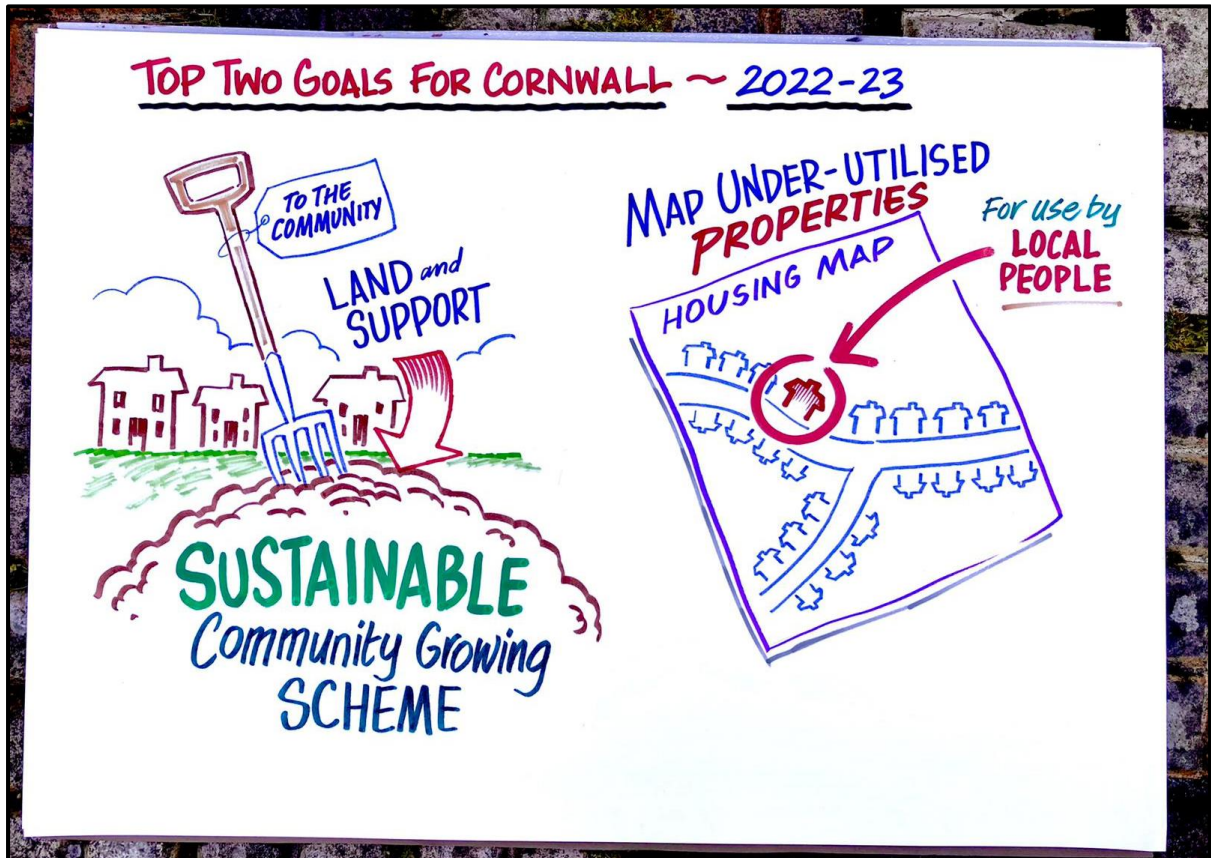
Figure 4: The final two goals prioritise at the Civic Lantern. Illustration by Keith Sparrow